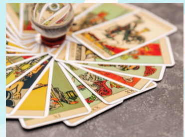
Astrology Class & Tarot Reading