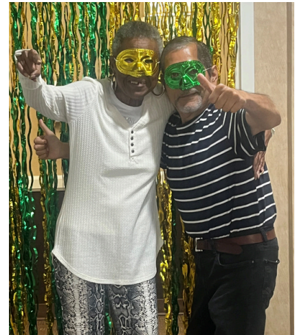
Mardi Gras Celebration! Check Out These Hand-Painted Masks!