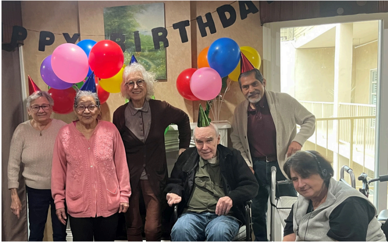
Celebrating March Birthdays!