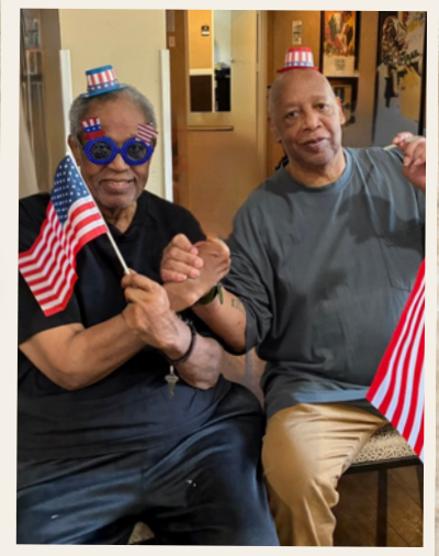
Celebrating Independence Day