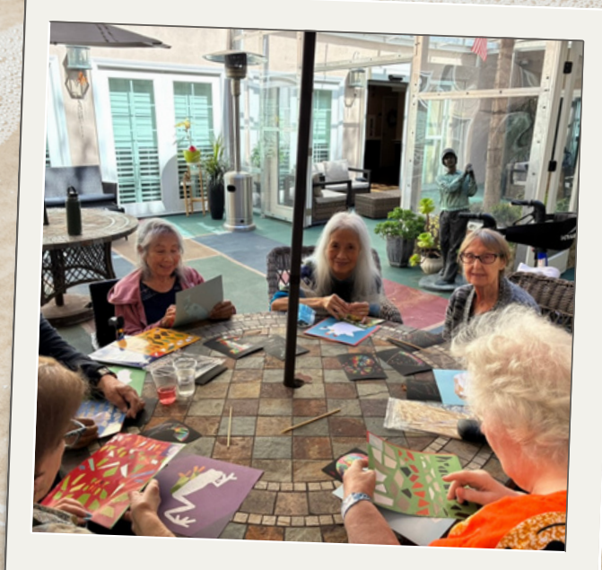
Crafting on the Patio