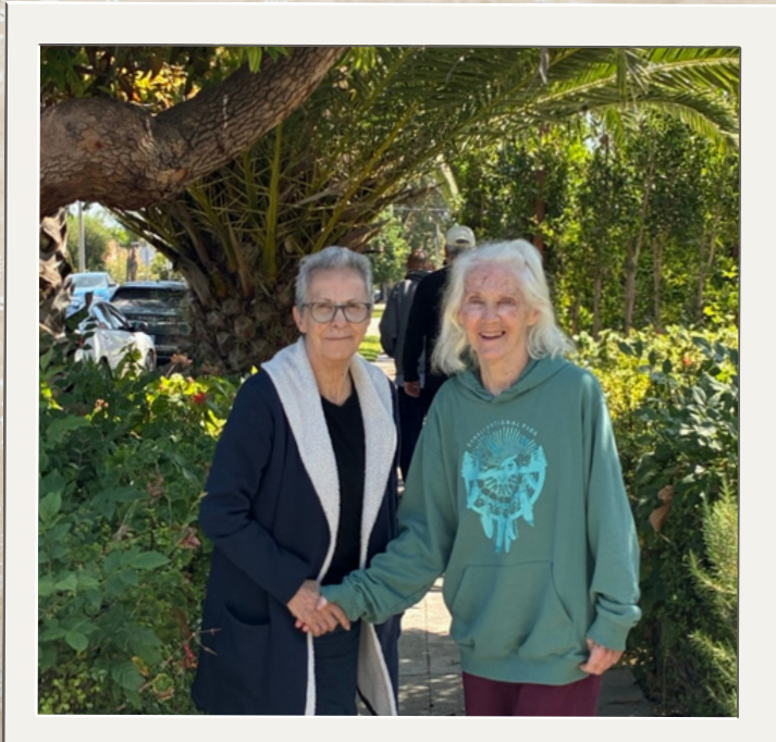
Enjoying the great outdoors on our daily walks