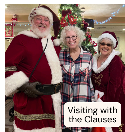
Visiting with the Clauses