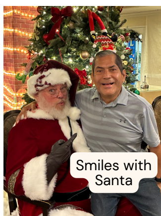
Smiles with Santa