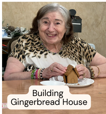
Building Gingerbread House