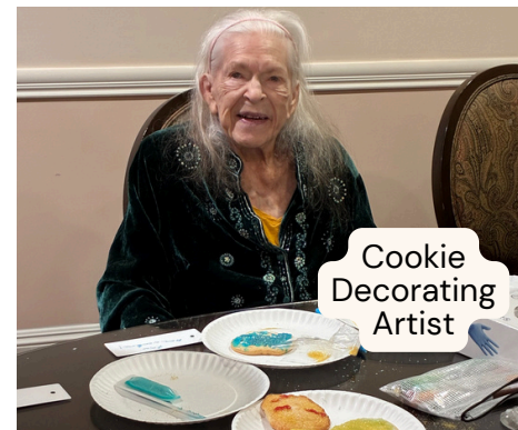
Cookie Decorating Artist