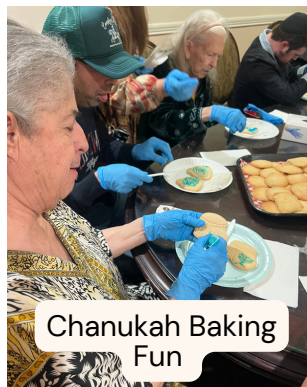
Chanukah Baking Fun