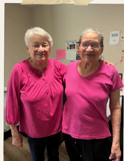
When friendship and fashion match perfectly!