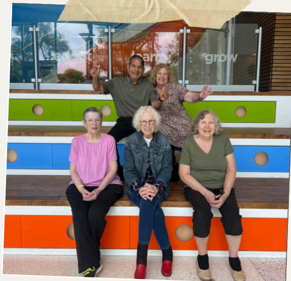
We visited the shelter and the animals made our day!