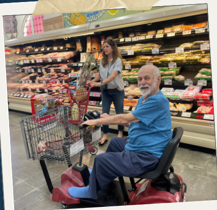
Rolling through Trader Joe's in style!