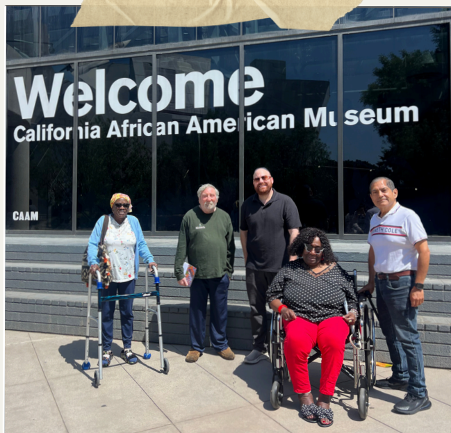
Honoring Juneteenth with an outing to the African American Museum