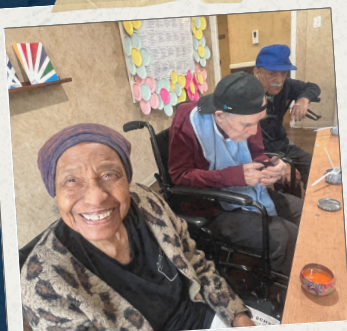
Candle Making Workshop