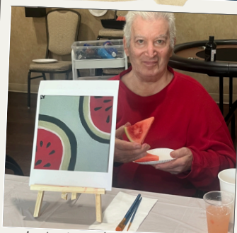
Art that's juicy and sweet...