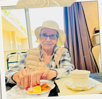
One more sugar cube, please!