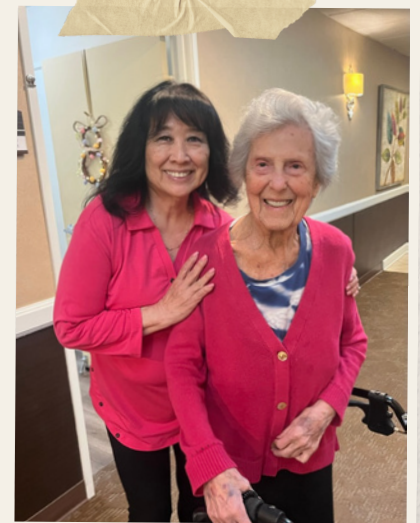
On Wednesdays we wear pink...