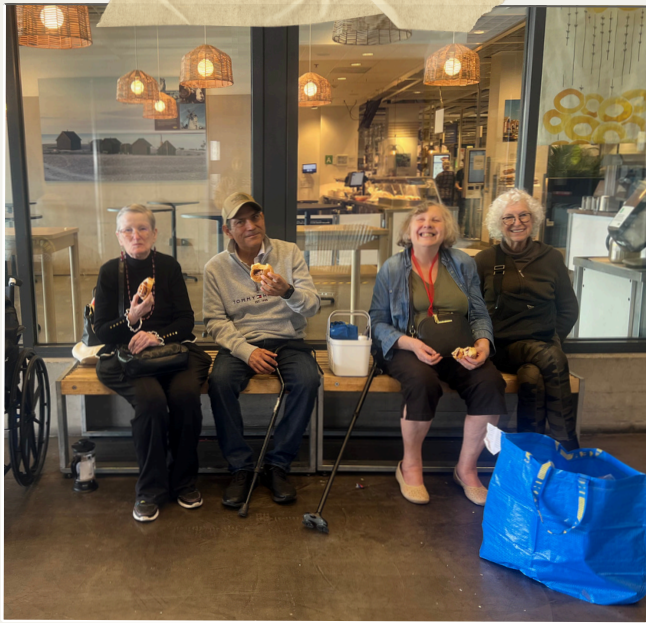
Wrapping up our IKEXA run with warm cinnamon rolls