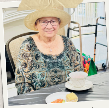
This is my cup of tea...