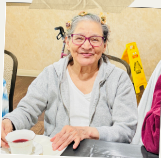
Tea Party Queen