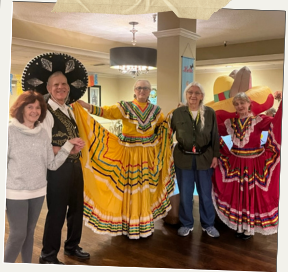
Mariachi Dancers Cinco De Mayo