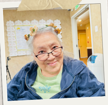
steeped in charm