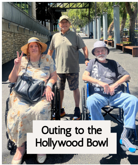
Outing to the Hollywood Bowl