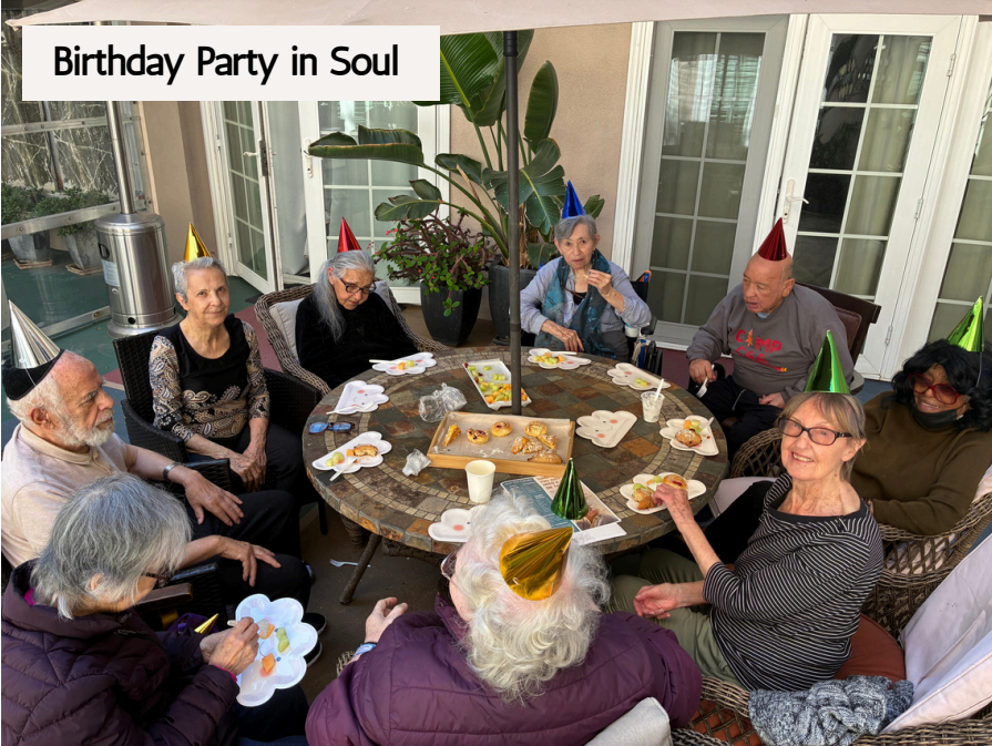
Birthday Party in Soul