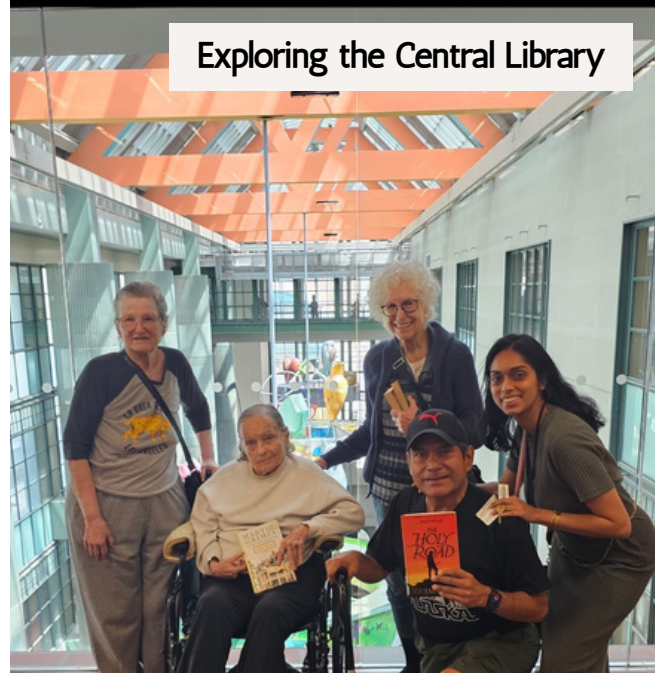
Exploring the Central Library