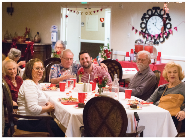
Valentine's Day at CityView